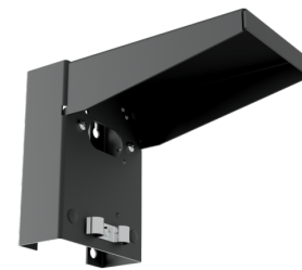
Wall holder with weather protection Art.No: 93221

Dimensions: 188 x 98 x 134 mm Material color: white