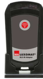
BLE-IR-Adapter Art.No: 93067

Voltage: 230 V AC \pm 10\% Dimensions: 50 x 23 x 8 mm Degree / class of protection: IP20 / Class II