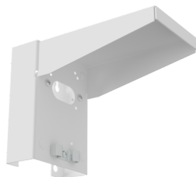
Wall holder with weather protection Art.No: 93222

Dimensions: 188 x 98 x 134 mm Housing: stainless steel Material color: stainless steel