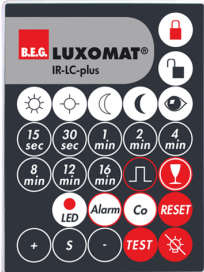
IR-LC-plus Art.No: 92095

Dimensions: 40 x 55 x 103 mm Material color: black Frequency: 2.4 GHz ISM band, GFSK 0.2 dBm + 5.3 dBi = 5.5 dBm