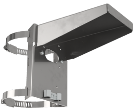
Pole holder with weather protection Art.No: 93220

Dimensions: Ø 164 x 143 mm Impact strength: IK09 Housing: coated steel basket