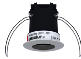
Mounting set PICO Art.No: 93777

Dimensions: Ø 45 x 50 mm Degree / class of protection: IP20 Housing: polycarbonate, UV-resistant