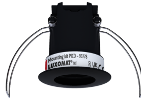
Mounting set PICO Art.No: 93778

Dimensions: Ø 45 x 50 mm Degree / class of protection: IP20 Housing: polycarbonate, UV-resistant