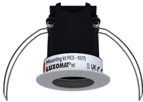
Mounting set PICO Art.No: 93775

Battery: 3.0 V Lithium CR2032 (inclusive) Dimensions: 57 x 35 x 7 mm Material color: -