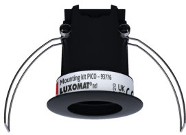
Mounting set PICO Art.No: 93776

Dimensions: Ø 45 x 50 mm Degree / class of protection: IP20 Housing: polycarbonate, UV-resistant