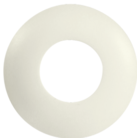
Cover ring PD9 Ø 45 mm Art.No: 92327

Dimensions: Ø 36 mm Housing: polycarbonate, UV-resistant Material color: silver glossy