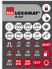
IR-PD9 Art.No: 92201

Dimensions: 40 x 55 x 103 mm Material color: black Frequency: 2.4 GHz ISM band, GFSK 0.2 dBm + 5.3 dBi = 5.5 dBm