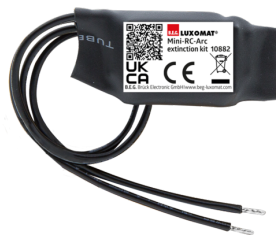
Mini-RC-Arc extinction kit Art.No: 10882

Voltage: 230 V AC ±10% Dimensions: 38 x 12 x 26 mm Degree / class of protection: IP20 / Class II