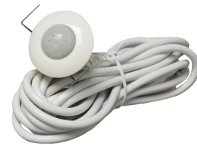
PD9-S-SDB-FC Art.No: 92915

Voltage: 230 V AC ±10% Dimensions: 50 x 23 x 8 mm Degree / class of protection: IP20 / Class II