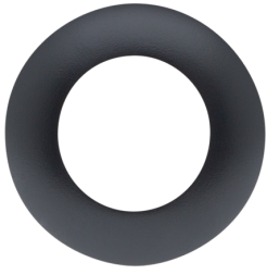
Cover ring PD9 Ø 36 mm Art.No: 92235

Dimensions: Ø 36 mm Housing: polycarbonate, UV-resistant Material color: anthracite glossy