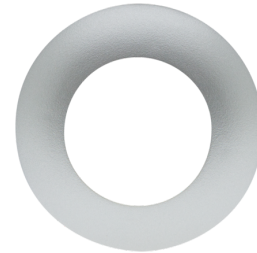
Cover ring PD9 Ø 36 mm Art.No: 92237

Dimensions: Ø 36 mm Housing: polycarbonate, UV-resistant Material color: white glossy