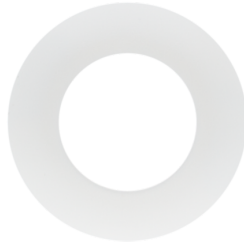
Cover ring PD9 Ø 36 mm Art.No: 92238

Dimensions: Ø 36 mm Housing: polycarbonate, UV-resistant Material color: anthracite glossy