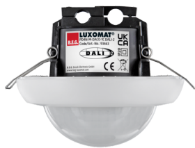
PD4N-M-DACO-1C DALI-2 Art.No: 93463

To receive the bundle according to the technical specification, please order the items listed.