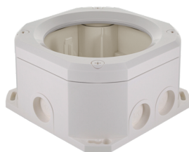
SM socle mounting set IP65 PD4N Art.No: 93314

Voltage: 230 V AC \pm 10\% 50 Hz Dimensions: \varnothing 106 x 95 mm Power consumption: approx. 2 W