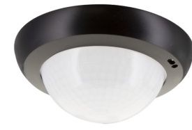
lens PD4N, Cover ring Art.No: 93733

Detection area: horizontal 360° (Ceiling mounting) Range: max. &Oslash; 24 m across<br>max. &Oslash; 8 m towards<br>max. &Oslash; 6.4 m seated Monitored area (tangential movement): 450 m 2 / 2.5 m mounting height