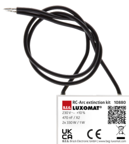
RC-Arc extinction kit Art.No: 10880

Voltage: 230 V AC \pm 10\% Dimensions: 38 x 12 x 26 mm Degree / class of protection: IP20 / Class II