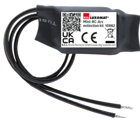
Mini-RC-Arc extinction kit Art.No: 10882

Voltage: 230 V AC \pm 10\% Dimensions: 38 x 12 x 26 mm Degree / class of protection: IP20 / Class II