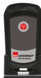
BLE-IR-Adapter Art.No: 93067

Voltage: 230 V AC \pm 10\% Dimensions: 50 x 23 x 8 mm Degree / class of protection: IP20 / Class II