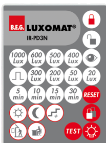
IR-PD3N Art.No: 92105

Dimensions: 40 x 55 x 103 mm Material color: black Frequency: 2.4 GHz ISM band, GFSK 0.2 dBm + 5.3 dBi = 5.5 dBm