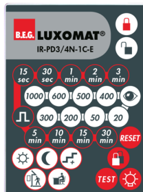
IR-PD3/4N-1C-E Art.No: 93110

Battery: 3.0 V Lithium CR2032 (inclusive) Dimensions: 80 x 60 x 8 mm Material color: -