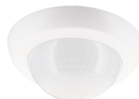
lens PD4N-1C, Cover ring Art.No: 93737

Detection area: horizontal 360° (Ceiling mounting) Range: max. &Oslash; 24 m across<br>max. &Oslash; 8 m towards<br>max. &Oslash; 6.4 m seated Monitored area (tangential movement): 450 m 2 / 2.5 m mounting height