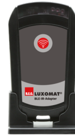
BLE-IR-Adapter Art.No: 93067

Voltage: 230 V AC \pm 10\% Dimensions: 50 x 23 x 8 mm Degree / class of protection: IP20 / Class II