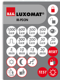
IR-PD3N Art.No: 92105

Dimensions: 47 x 19 x 10 mm Degree / class of protection: IP20 Ambient temperature: -20 °C to +40 °C