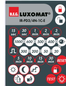
IR-PD3/4N-1C-E Art.No: 93110

Battery: 3.0 V Lithium CR2032 (inclusive) Dimensions: 80 x 60 x 8 mm Material color: -