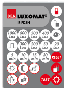
IR-PD3N Art.No: 92105

Dimensions: 47 x 19 x 10 mm Degree / class of protection: IP20 Ambient temperature: -20 °C to +40 °C