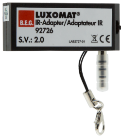
IR-Adapter for Smartphones Art.No: 92726

Dimensions: 40 x 55 x 103 mm Material color: black Frequency: 2.4 GHz ISM band, GFSK 0.2 dBm + 5.3 dBi = 5.5 dBm