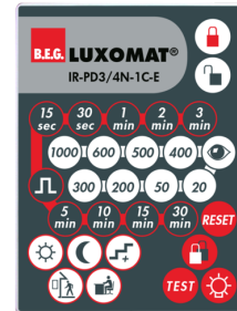
IR-PD3/4N-1C-E Art.No: 93110

Battery: 3.0 V Lithium CR2032 (inclusive) Dimensions: 80 x 60 x 8 mm Material color: -