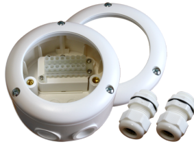
Surface mounting socket IP65 PD4-SM IP54 Art.No: 92376

Dimensions: 40 x 55 x 103 mm Material color: black Frequency: 2.4 GHz ISM band, GFSK 0.2 dBm + 5.3 dBi = 5.5 dBm