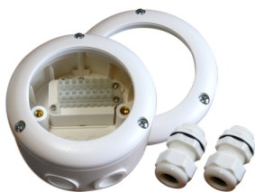
Surface mounting socket IP65 PD4-SM IP54 Art.No: 92376

Voltage: 110 – 240 V AC 50 / 60 Hz Dimensions: Ø 101 x 76 mm Power consumption: approx. 0.2 W