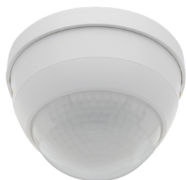
PD4-S-C-SM Art.No: 92442

To receive the bundle according to the technical specification, please order the items listed.