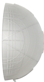
Blinds PD4 Art.No: 92313

Dimensions: 1 : Ø 113 x 79 mm, 2 : Ø 113 x 34 mm Housing: polycarbonate, UV-resistant Material color: white, similar to RAL9010