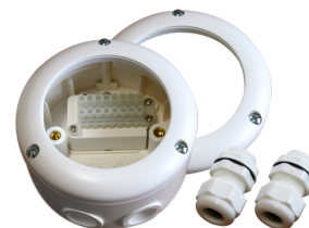
Surface mounting socket IP65 PD4-SM IP54 Art.No: 92376

Dimensions: 130 x 100 x 53 mm Housing: polycarbonate, UV-resistant Material color: white