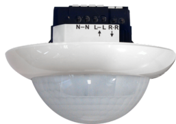
PD4-S-C-FM Art.No: 92445

To receive the bundle according to the technical specification, please order the items listed.