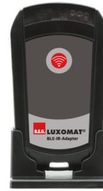
BLE-IR-Adapter Art.No: 93067

Voltage: 230 V AC \pm 10\% Dimensions: 50 x 23 x 8 mm Degree / class of protection: IP20 / Class II