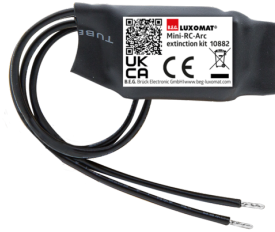
Mini-RC-Arc extinction kit Art.No: 10882

Voltage: 230 V AC \pm 10\% Dimensions: 38 x 12 x 26 mm Degree / class of protection: IP20 / Class II