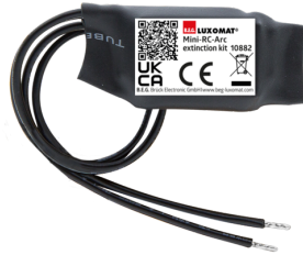
Mini-RC-Arc extinction kit Art.No: 10882

Voltage: 230 V AC ±10% Dimensions: 38 x 12 x 26 mm Degree / class of protection: IP20 / Class II