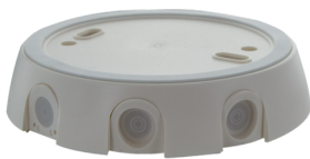
Socket IP54 PD4-TRIO-SM Art.No: 92386

Battery: 3.0 V Lithium CR2032 (inclusive) Dimensions: 80 x 60 x 8 mm Material color: -