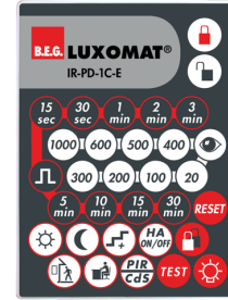
IR-PD-1C-E Art.No: 92077

Battery: 3.0 V Lithium CR2032 (inclusive) Dimensions: 57 x 35 x 7 mm Material color: -