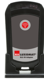
BLE-IR-Adapter Art.No: 93067

Voltage: 230 V AC ±10% Dimensions: 50 x 23 x 8 mm Degree / class of protection: IP20 / Class II