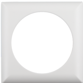
Square design frame PD4-FC Art.No: 92992

Battery: 3.0 V Lithium CR2032 (inclusive) Dimensions: 80 x 60 x 8 mm Material color: -