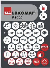
IR-PD-2C Art.No: 92475

Dimensions: 40 x 55 x 103 mm Material color: black Frequency: 2.4 GHz ISM band, GFSK 0.2 dBm + 5.3 dBi = 5.5 dBm