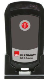
BLE-IR-Adapter Art.No: 93067

Voltage: 230 V AC \pm 10\% Dimensions: 50 x 23 x 8 mm Degree / class of protection: IP20 / Class II