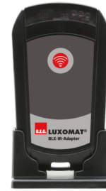
BLE-IR-Adapter Art.No: 93067

Voltage: 230 V AC \pm 10\% Dimensions: 50 x 23 x 8 mm Degree / class of protection: IP20 / Class II