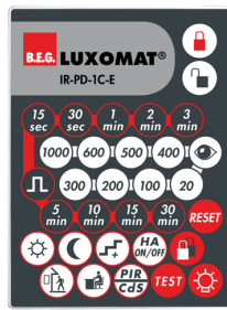
IR-PD-1C-E Art.No: 92077

Battery: 3.0 V Lithium CR2032 (inclusive) Dimensions: 80 x 60 x 8 mm Material color: -