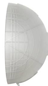
Blinds PD4 Art.No: 92313

Dimensions: 101 x 101 x 11.8 mm Housing: polycarbonate, UV-resistant Material color: pure white mat, similar to RAL9010