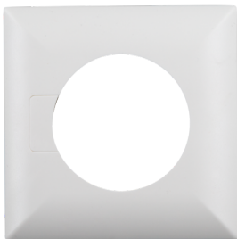
Square design frame PD3N-FC Art.No: 92991

Dimensions: Ø 200 x 90 mm Impact strength: IK09 Housing: coated steel basket