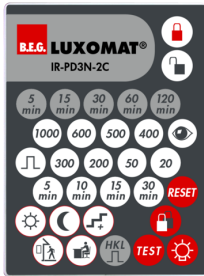
IR-PD3N-2C Art.No: 92115

Dimensions: 40 x 55 x 103 mm Material color: black Frequency: 2.4 GHz ISM band, GFSK 0.2 dBm + 5.3 dBi = 5.5 dBm