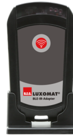
BLE-IR-Adapter Art.No: 93067

Voltage: 230 V AC \pm 10\% Dimensions: 50 x 23 x 8 mm Degree / class of protection: IP20 / Class II