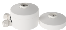
Pendulum mounting set PD2/3/4 SM Art.No: 93179

Dimensions: Ø 200 x 90 mm Impact strength: IK09 Housing: coated steel basket