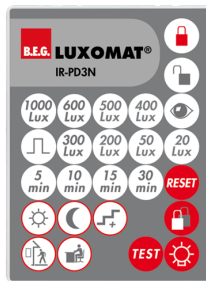
IR-PD3N Art.No: 92105

Battery: 3.0 V Lithium CR2032 (inclusive) Dimensions: 80 x 60 x 8 mm Material color: -