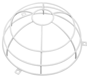
Wire basket BSK (Ø 200 x 90 mm) Art.No: 92199

Battery: 3.0 V Lithium CR2032 (inclusive) Dimensions: 57 x 35 x 7 mm Material color: -