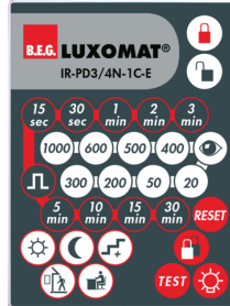
IR-PD3/4N-1C-E Art.No: 93110

Battery: 3.0 V Lithium CR2032 (inclusive) Dimensions: 80 x 60 x 8 mm Material color: -