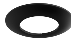
Cover ring PD3N FC Art.No: 93086

Dimensions: 83 x 83 x 8 mm Housing: polycarbonate, UV-resistant Material color: white mat, similar to RAL9010