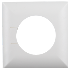
Square design frame PD3N-FC Art.No: 92991

Dimensions: Ø 200 x 90 mm Impact strength: IK09 Housing: coated steel basket