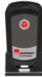
BLE-IR-Adapter Art.No: 93067

Voltage: 230 V AC \pm 10\% Dimensions: 50 x 23 x 8 mm Degree / class of protection: IP20 / Class II