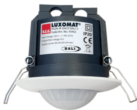
PD2N-M-DACO DALI-2 Art.No: 93452

To receive the bundle according to the technical specification, please order the items listed.