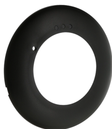
Cover ring PD2N FC Art.No: 93773

Voltage: 230 V AC \pm 10\% 50 Hz Dimensions: \varnothing 84 \times 85 mm Power consumption: approx. 2 W