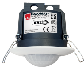
PD2N-M-DACO-1C DALI-2 Art.No: 93455

To receive the bundle according to the technical specification, please order the items listed.