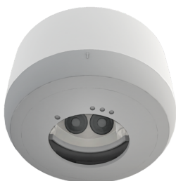
SM socle mounting set IP54 PD2N H Art.No: 93454

Voltage: 230 V AC \pm 10\% 50 Hz Dimensions: \varnothing 84 \times 85 mm Power consumption: approx. 2 W