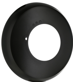
Cover ring PD2N FM Art.No: 93763

Dimensions: Ø 109 x 19 mm Degree / class of protection: IP54 Housing: polycarbonate, UV- resistant