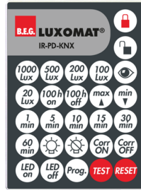
IR-PD-KNX Art.No: 92123

Dimensions: 40 x 55 x 103 mm Material color: black Frequency: 2.4 GHz ISM band, GFSK 0.2 dBm + 5.3 dBi = 5.5 dBm