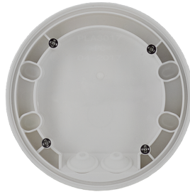
SM socle mounting set IP54 PD2N- / PD4N-FM Art.No: 93752

Dimensions: Ø 109 x 19 mm Degree / class of protection: IP54 Housing: polycarbonate, UV-resistant