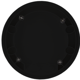
SM socle mounting set IP54 PD2N- / PD4N-FM Art.No: 93753

Dimensions: Ø 109 x 19 mm Degree / class of protection: IP54 Material color: white, similar to RAL9010