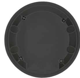
SM socle mounting set IP54 PD2N- / PD4N-FM Art.No: 93751

Dimensions: Ø 109 x 19 mm Degree / class of protection: IP54 Housing: polycarbonate, UV-resistant