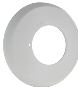
Cover ring PD2N FM Art.No: 93762

Dimensions: Ø 106 x 20 mm Impact strength: IK05 Housing: polycarbonate, UV-resistant