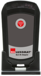
BLE-IR-Adapter Art.No: 93067

Dimensions: 40 x 55 x 103 mm Material color: black Frequency: 2.4 GHz ISM band, GFSK 0.2 dBm + 5.3 dBi = 5.5 dBm