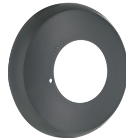
Cover ring PD2N FM Art.No: 93761

Dimensions: Ø 106 x 20 mm Impact strength: IK05 Housing: polycarbonate, UV-resistant