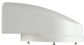
Wall holder PD2N/4N Typ A Art.No: 93164

Dimensions: Ø 200 x 90 mm Impact strength: IK09 Housing: coated steel basket