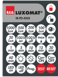
IR-PD-KNX Art.No: 92123

Dimensions: 40 x 55 x 103 mm Material color: black Frequency: 2.4 GHz ISM band, GFSK 0.2 dBm + 5.3 dBi = 5.5 dBm