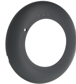
Cover ring PD2N FC Art.No: 93771

Battery: 3.0 V Lithium CR2032 (inclusive) Dimensions: 57 x 35 x 7 mm Material color: -