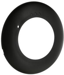
Cover ring PD2N FC Art.No: 93773

Dimensions: 40 x 55 x 103 mm Material color: black Frequency: 2.4 GHz ISM band, GFSK 0.2 dBm + 5.3 dBi = 5.5 dBm