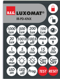
IR-PD-KNX Art.No: 92123

Dimensions: Ø 200 x 90 mm Impact strength: IK09 Housing: coated steel basket