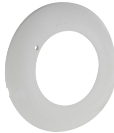
Cover ring PD2N FC Art.No: 93772

Battery: 3.0 V Lithium CR2032 (inclusive) Dimensions: 80 x 60 x 8 mm Material color: -