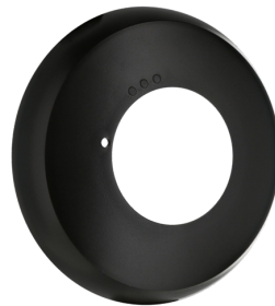
Cover ring PD2N FM Art.No: 93763

Dimensions: Ø 109 x 19 mm Degree / class of protection: IP54 Material color: white, similar to RAL9010