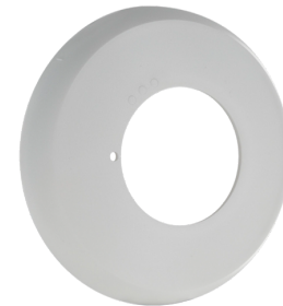
Cover ring PD2N FM Art.No: 93762

Dimensions: Ø 106 x 20 mm Impact strength: IK05 Housing: polycarbonate, UV-resistant