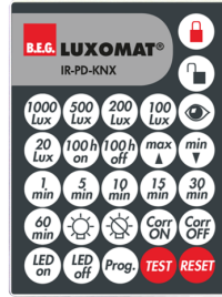
IR-PD-KNX Art.No: 92123

Dimensions: 40 x 55 x 103 mm Material color: black Frequency: 2.4 GHz ISM band, GFSK 0.2 dBm + 5.3 dBi = 5.5 dBm