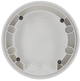
SM socle mounting set IP54 PD2N- / PD4N-FM Art.No: 93307

Dimensions: Ø 109 x 19 mm Degree / class of protection: IP54 Housing: polycarbonate, UV-resistant