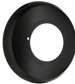
Cover ring PD2N FM Art.No: 93763

Dimensions: Ø 109 x 19 mm Degree / class of protection: IP54 Material color: white, similar to RAL9010