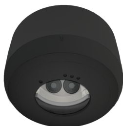
SM socle mounting set IP54 PD2N H Art.No: 93783

Voltage: 230 V AC \pm 10\% 50 Hz Dimensions: \varnothing 84 \times 85 mm Settings: Casambi App