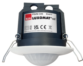
PD2N-CAS Art.No: 93477

To receive the bundle according to the technical specification, please order the items listed.