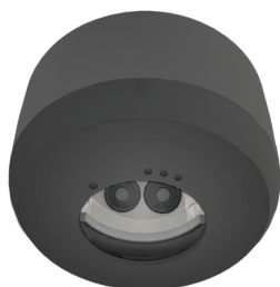
SM socle mounting set IP54 PD2N H Art.No: 93781

Voltage: 230 V AC \pm 10\% 50 Hz Dimensions: \varnothing 84 \times 85 mm Settings: Casambi App