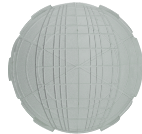
Blinds PD2-FC Art.No: 36635

Battery: 3.0 V Lithium CR2032 (inclusive) Dimensions: 57 x 35 x 7 mm Material color: -