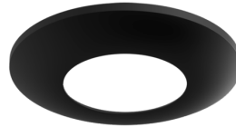
Cover ring PD2/PD3 FC Art.No: 93085

Battery: 3.0 V Lithium CR2032 (inclusive) Dimensions: 80 x 60 x 8 mm Material color: -