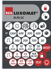
IR-PD-2C Art.No: 92475

Dimensions: Ø 200 x 90 mm Impact strength: IK09 Housing: coated steel basket