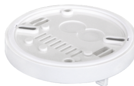
SM socket IP54 for PD2- / PD4-SM Art.No: 92161

Dimensions: Ø 200 x 90 mm Impact strength: IK09 Housing: coated steel basket