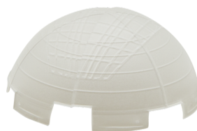
Blinds PD2-SM Art.No: 92260

Dimensions: Ø 200 x 90 mm Impact strength: IK09 Housing: coated steel basket