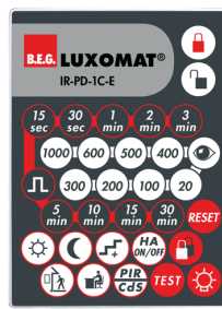
IR-PD-1C-E Art.No: 92077

Battery: 3.0 V Lithium CR2032 (inclusive) Dimensions: 80 x 60 x 8 mm Material color: -