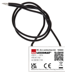
RC-Arc extinction kit Art.No: 10880

Voltage: 230 V AC \pm 10\% Dimensions: 38 x 12 x 26 mm Degree / class of protection: IP20 / Class II