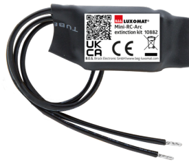
Mini-RC-Arc extinction kit Art.No: 10882

Voltage: 230 V AC \pm 10\% Dimensions: 38 x 12 x 26 mm Degree / class of protection: IP20 / Class II