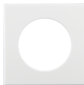
Square design frame PD11-FC Art.No: 92994

Dimensions: Ø 104 mm Material color: white