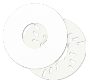
In-wall mounting set / PD11 Art.No: 92833

Voltage: 110 – 240 V AC 50 / 60 Hz Dimensions: Ø 52 x 60 mm Power consumption: approx. 0.2 W