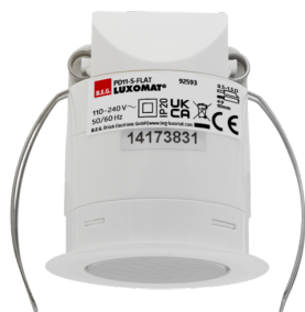
PD11-S-FLAT-FC Art.No: 92593

To receive the bundle according to the technical specification, please order the items listed.