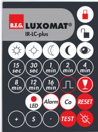
IR-LC-plus Art.No: 92095

Dimensions: 40 x 55 x 103 mm Material color: black Frequency: 2.4 GHz ISM band, GFSK 0.2 dBm + 5.3 dBi = 5.5 dBm