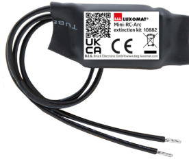
Mini-RC-Arc extinction kit Art.No: 10882

Voltage: 230 V AC ±10% Dimensions: 38 x 12 x 26 mm Degree / class of protection: IP20 / Class II