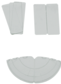
Blinds LC-Click-N Art.No: 32699

Dimensions: 188 x 98 x 134 mm Material color: anthracite