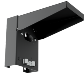
Wall holder Art.No: 93221

Dimensions: 188 x 98 x 134 mm Material color: white