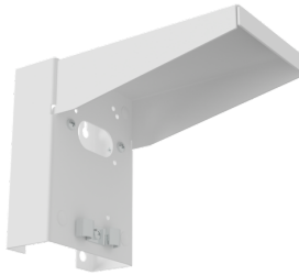
Wall holder Art.No: 93222

Dimensions: 188 x 98 x 134 mm Housing: stainless steel Material color: stainless steel