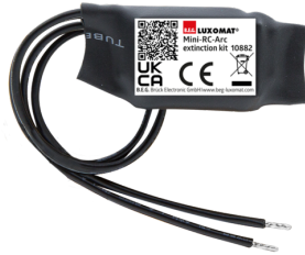
Mini-RC-Arc extinction kit Art.No: 10882

Voltage: 230 V AC ±10% Dimensions: 38 x 12 x 26 mm Degree / class of protection: IP20 / Class II