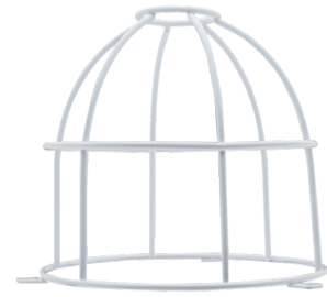
Wire basket BSK (Ø 164 x 143 mm) Art.No: 92467

Voltage: 230 V AC ±10% Dimensions: 50 x 23 x 8 mm Degree / class of protection: IP20 / Class II