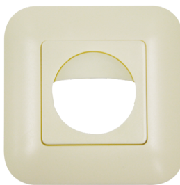
Frame IP20 Indoor 180 Art.No: 92632

Voltage: 11 - 48 V AC / DC Dimensions: covering not included 70 x 70 x 61 mm Power consumption: approx. 1 W