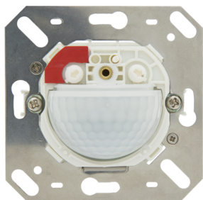
Indoor 180-R-11-48V-3A covering not included Art.No: 92666

To receive the bundle according to the technical specification, please order the items listed.