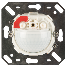
Indoor 180-M-2C covering not included Art.No: 92661

To receive the bundle according to the technical specification, please order the items listed.