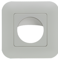
Frame IP20 Indoor 180 Art.No: 92630

Battery: 3.0 V Lithium CR2032 (inclusive) Dimensions: 57 x 35 x 7 mm Material color: -