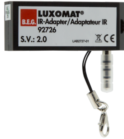
IR-Adapter for Smartphones Art.No: 92726

Dimensions: 40 x 55 x 103 mm Material color: black Frequency: 2.4 GHz ISM band, GFSK 0.2 dBm + 5.3 dBi = 5.5 dBm