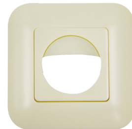
Frame IP20 Indoor 180 Art.No: 92632

Dimensions: 87 x 87 mm Degree / class of protection: IP54 Housing: polycarbonate, UV-resistant