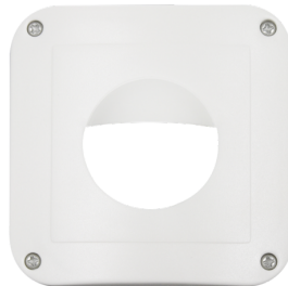
Frame IP54 Indoor 180 Art.No: 92139

Dimensions: 86 x 86 mm Degree / class of protection: IP20 Housing: polycarbonate, UV-resistant