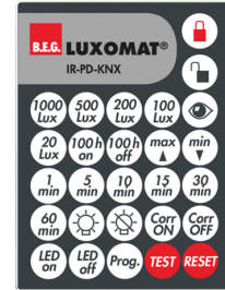
IR-PD-KNX Art.No: 92123

Dimensions: 47 x 19 x 10 mm Degree / class of protection: IP20 Ambient temperature: -20 °C to +40 °C