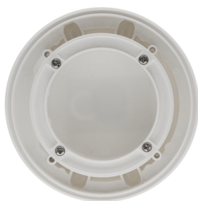
Mounting set BL4-SM Art.No: 93183

Voltage: 110 – 240 V AC 50 / 60 Hz Dimensions: Ø 104.5 x 84 mm Power consumption: approx. 0.3 W