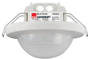
BL4-PLUS-FC Art.No: 93404

To receive the bundle according to the technical specification, please order the items listed.